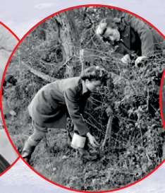
Women's Land Army